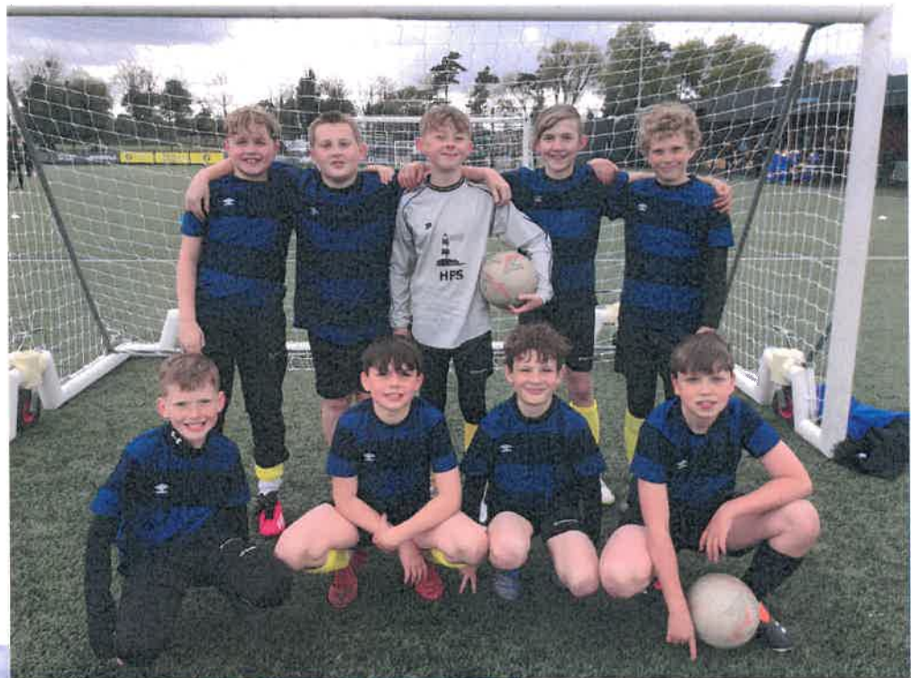
Year 6 Football Team