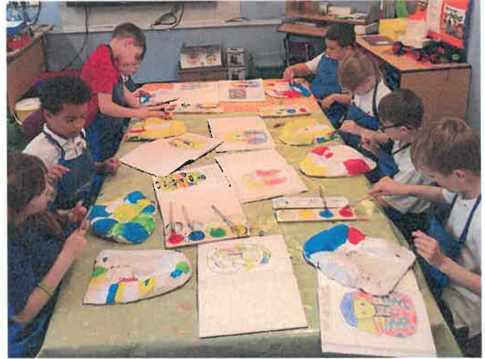
Kingfishers had lots of fun painting their Egyptian Death Masks this week!