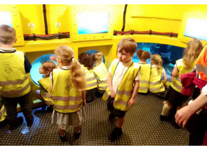
Cygnets trip to the Sea Life Centre