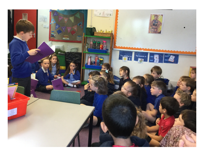
Robins sharing their storing writing with Swans