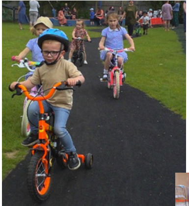
Cygnets did a wonderful job of respectfully welcoming pre-school pupils